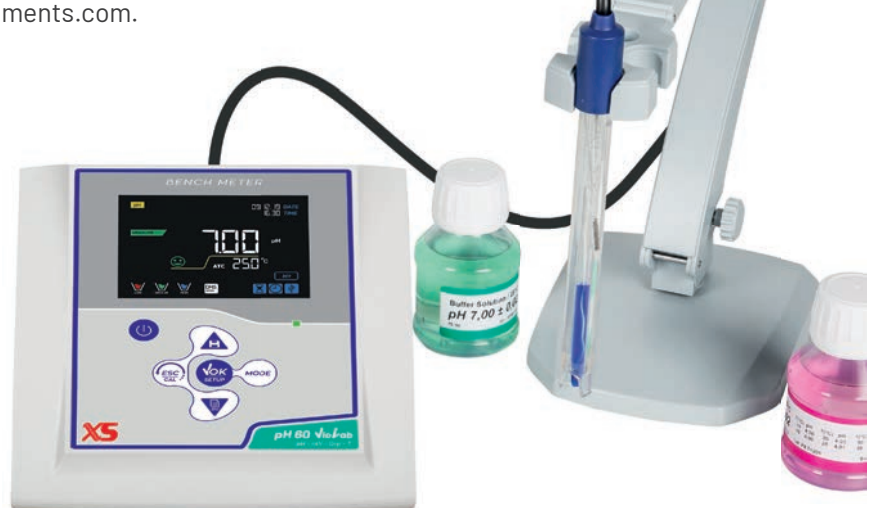
Only 6 buttons to easily manage all the functions of the instrument.