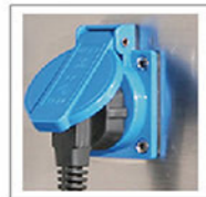
Waterproof Socket 2 waterproof sockets are located in the side panel, for optimum convenience of using small devices inside the cabinet.