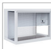
Side Glass Window The transparent side glass windows maximize light and visibility inside the cabinet, providing a bright and open working environment.