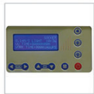
LCD Display Airflow velocity, UV timer, UV work time, system work time, real time.